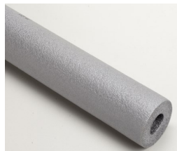
III. 2: Pipe Insulation 18/13