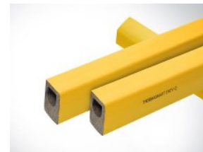
III. 4: Insulating Sleeve