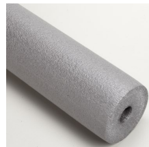
III. 3: Pipe Insulation 18/26