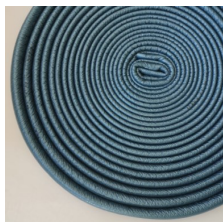
III. 1: Protection Hose